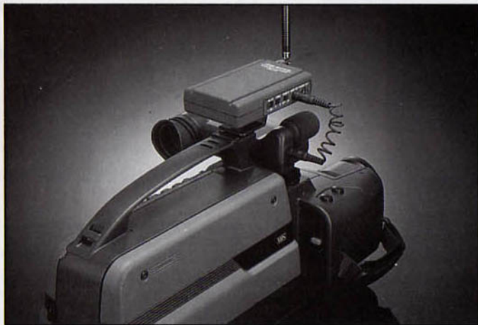
PRO 88W receiver mounted to video camcorder accessory shoe

The receiver can be mounted to a video camcorder by means of the supplied mounting bracket. Insert the "head" end of the bracket into the grooved area on the back of the receiver and then insert the "foot" end to the mounting shoe of the video camcorder.