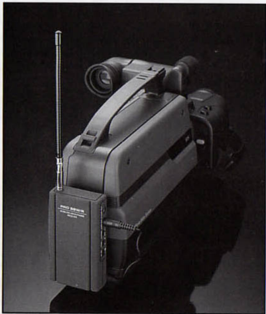
PRO 88W receiver mounted to video camcorder using supplied Velcro tape

The double-sided adhesive foam provided is only for permanent mounting of the receiver.