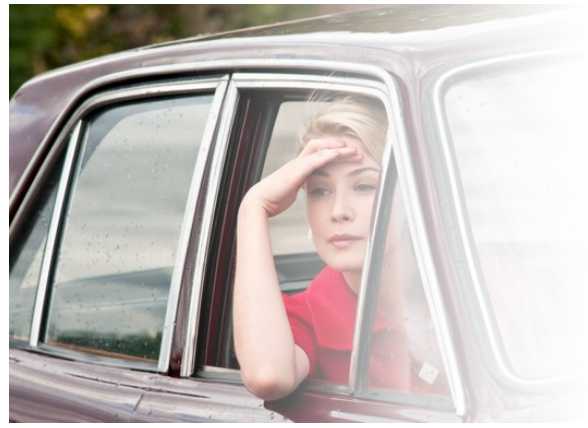
Made in Dagenham

Soul Kitchen centers on the life of Zinos, a likable but hopelessly disorganized restaurateur. When his girlfriend Nadine moves to Shanghai, a love-sick Zinos decides to fly after her, leaving his restaurant in the hands of his unreliable ex-con brother, Illias. Both decisions turn out disastrously: Illias gambles away the restaurant to a shady real estate agent, and Zinos finds Nadine with a new lover. But if the brothers can stop arguing and get it together, the Soul Kitchen might still have one last chance at staying in business. Akin perfectly captures the antic pace, eccentric personalities, and fickle fortunes of the restaurant game, and his vision of the Soul Kitchen as an all-night bacchanal is irresistible. 2009 Venice Film Festival, Young Cinema Award: Best Film. (Germany 2010) Dir: Fatih Akin. German language. 99 min.