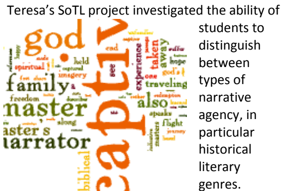
Partial Wordle from WTF poster