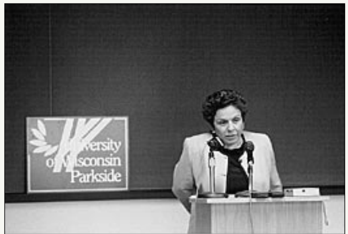
Health and Human Services Secretary Donna Shalala addresses reporters.

The floor was given a high-gloss finish that is expected to last at least 25 years. The volleyball and basketball teams began using the floor this fall.