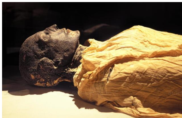
Mummy of King Seti I