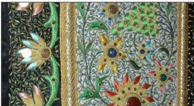
Jeweled Zardozi work carpet

For Islamic art and architecture, which are the products of a highly specific worldview, she again examines the works closely to discover what they have to say about themselves, and studies primary source texts concerning the nature of knowledge, the purpose of existence, the arrival of Islam, and the metaphysical and physical universes inferred by early religious scholars and astronomers.