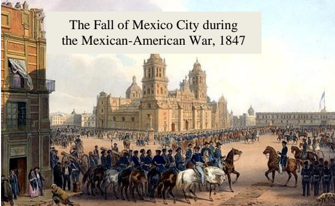
The Fall of Mexico City during the Mexican-American War, 1847

Two Fridays: September 7 & September 14 Molinaro D139 1 – 3 PM