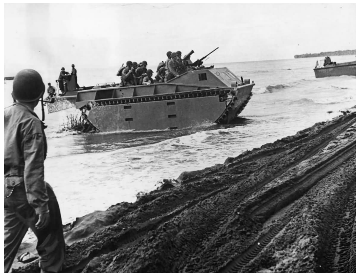
Marines Making an Amphibious Landing on Guadalcanal 1942