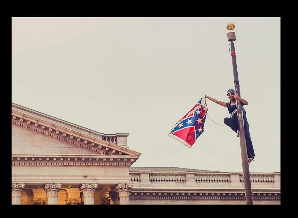
Bree Newsome Bass taking down the Confederate flag outside the North Carolina state house, June 27, 2015