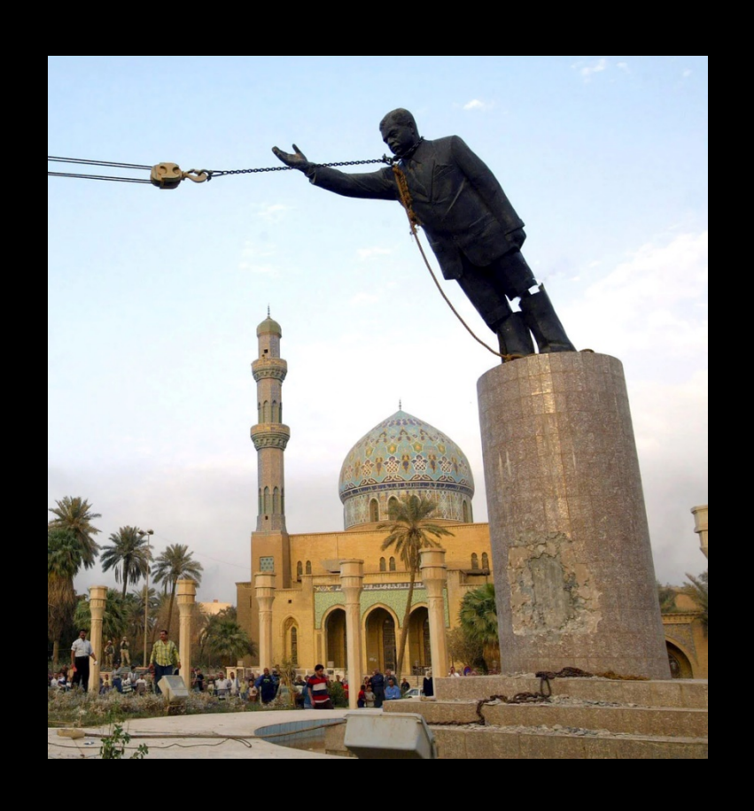
Statue of Saddam Hussein being pulled down in Firdaus Square, Bagdhad, on April 9, 2003