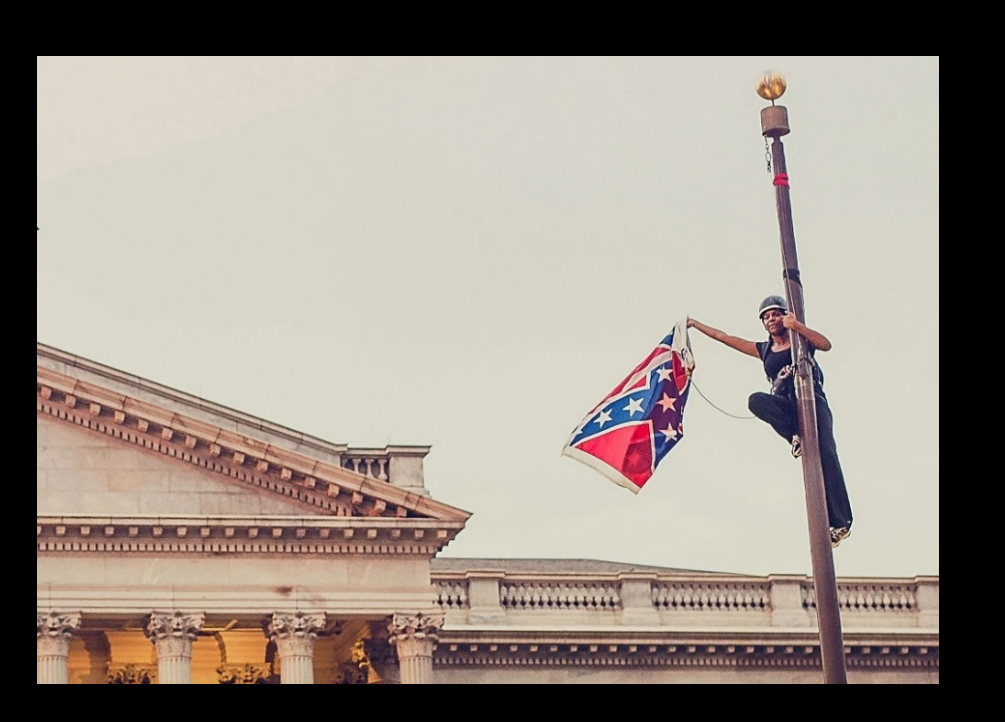
Bree Newsome Bass taking down the Confederate flag outside the North Carolina state house, June 27, 2015