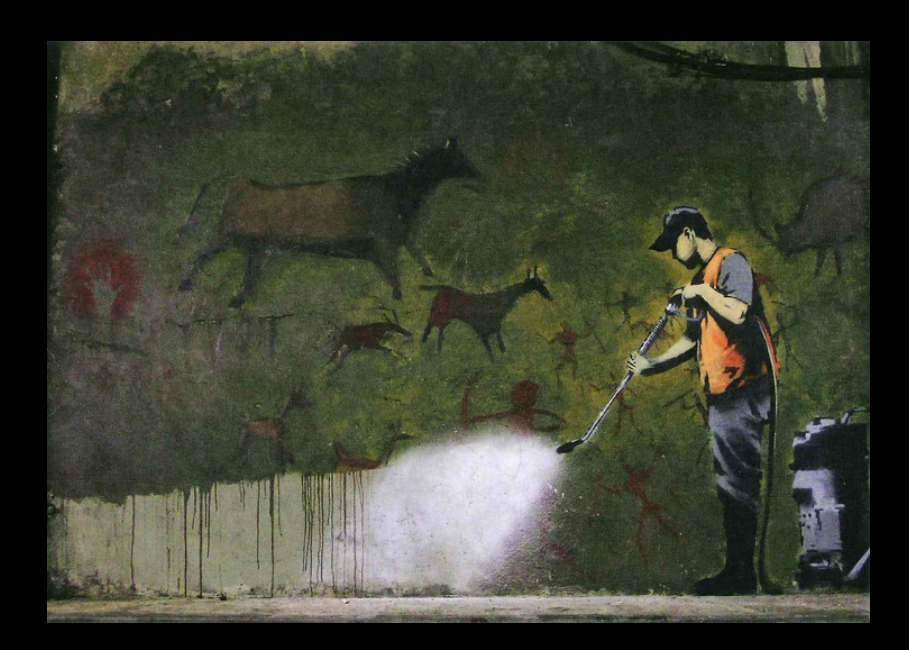
Banksy, Untitled , London, 2005