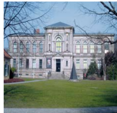
Herzog August Library