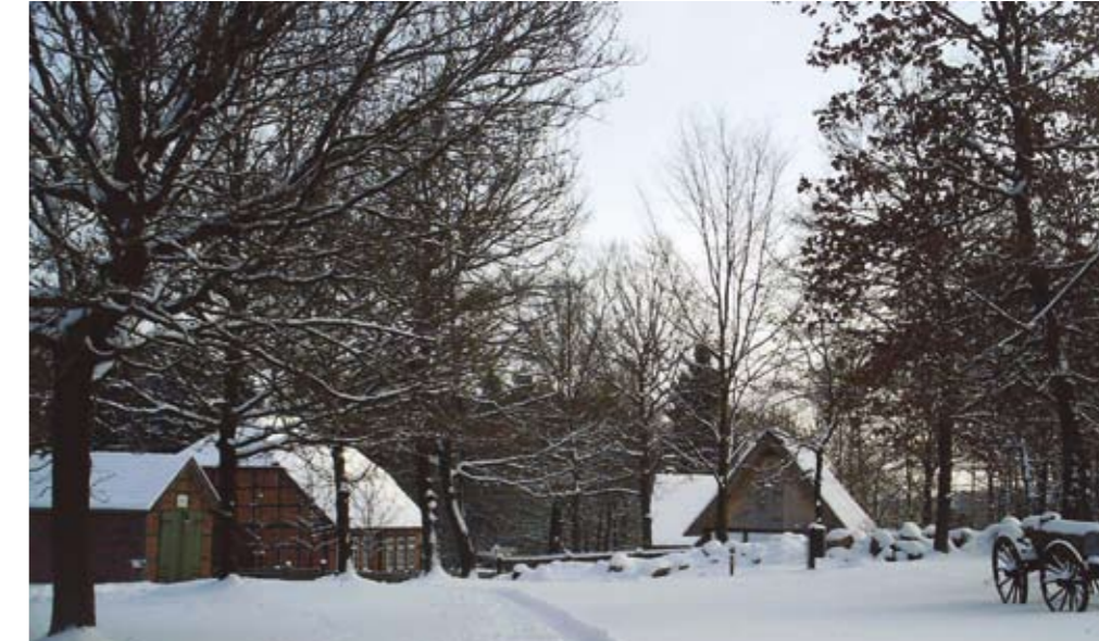
"Hösseringen" museum town

Located between Hamburg and Hannover, Suderburg is surrounded by one of Germany's most picturesque areas of outstanding natural beauty, the Lüneburg Heath. The wide variety of flora and fauna provide an ideal backdrop for a cycle trip or hike. If you find you have a yearning for city lights, you can take your pick between Hamburg and Hanover. Suderburg is a meeting place for students and lecturers from all four corners of the earth; at a current figure of three hundred and fifty young people enrolled, Ostfalia's Suderburg Campus has something of a family atmosphere – everyone knows each other, and personal contact is easy to keep between students and staff. This won't change in the future, even with the planned increase to a thousand students in the next few years.