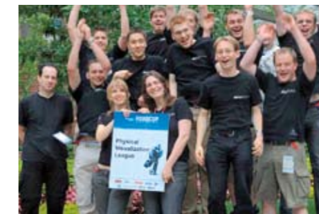
On the left: Successful since years: The RoboCup-Team. On the right: Ostfalia's Team wob-racing.

Ostfalia has its own network of partner universities on all five continents, reflecting the global affiliations of our business partners, our own university sites, and the Lower Saxony region. National and European support programmes contribute towards mobility in our students and teaching staff. All exchange programmes focus clearly on international negotiation skills, learning from best practice, and mutual understanding.