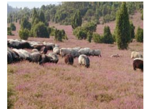
"Wacholderheide" near Suderburg