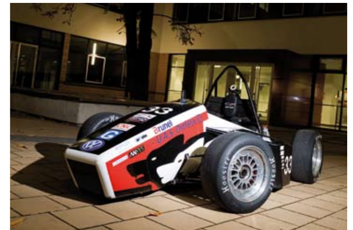
Ready for the "Formula Student": Ostfalia's racing-car.

"In my course of study I can spend the fifth and sixth semester abroad to achieve a double-degree there. In our globalized world, this a terrific chance, to stand out from the crowd with one's qualifications. This was the strongest argument for me to study at Ostfalia."