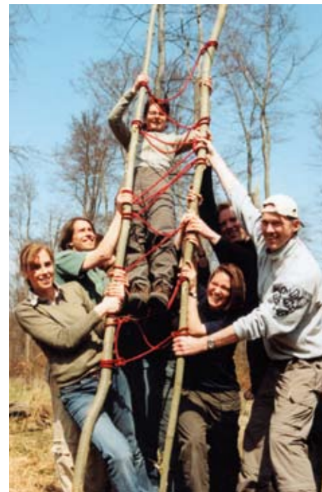
Together we stand: Outdoor-Training course students

If the only tool in your toolkit is a hammer, then you'll see every problem as a nail. Hardly any problem exists that can be solved by only one faculty; no product can be designed, manufactured and marketed by one discipline. It often makes sense to develop degree courses that involve more than one discipline, giving students the opportunity to understand several realms of activity. Ostfalia has introduced several degree courses along these lines, but we have taken it a step further.