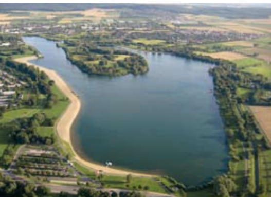
Salzgitter Lake with just under a mile of beach

Mention Salzgitter to most Germans, and they'll think of an industrial city. There is a lot of truth to that – Salzgitter is Lower Saxony's third-largest industrial location, with Northern Germany's largest inland port. Companies such as MAN and Salzgitter AG are based in Salzgitter, along with a variety of small and medium-sized businesses. But it's not all about industry in this city of a hundred thousand inhabitants, with historical buildings and public art displays, city festivals, cosy residential areas in lush, green surroundings, and of course, the Salzgittersee (Salzgitter Lake) water sports centre with just under a mile of beach and excellent water quality; a dream destination for water sports fans, swimmers, surfers, or anyone wanting to spend a relaxing summer's day on the beach. The mixed woods of the Salzgitter Hills are an invitation to mountain bikers and hikers, and Salzgitter-Bad spa health resort has one of Germany's largest natural thermal salt springs. If you think you'll be studying at a campus in the middle of a huge industrial estate, you're in for a surprise. The Karl Scharfenberg Faculty is based in the idyllic surroundings of Calbecht, in a renovated building that was once an office building of Salzgitter Erzbergbau AG (Salzgitter Ore Mining Company).