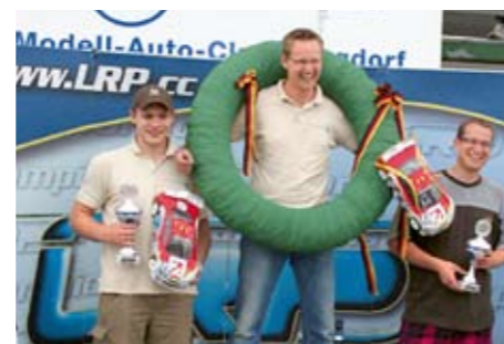
Up on the winners' rostrum: The Ostfalia RC model-building team