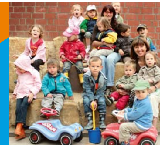
Die Kinder der Kita Zwergenbutze

Wherever you have thousands of people studying and hundreds working together, you have to nurture a relaxed, friendly atmosphere. This can only develop on a basis of mutual respect, tolerance and appreciation of others. This is exactly how we see ourselves. The open-door policy we practise in our services constitutes an important symbol in this fundamental approach.