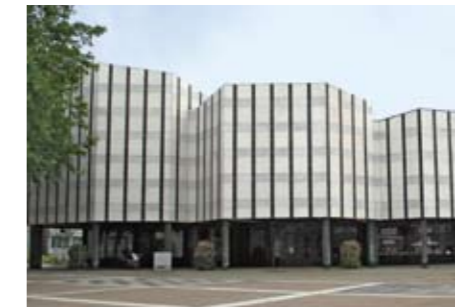
Above: Volkswagen Arena Soccer Stadium