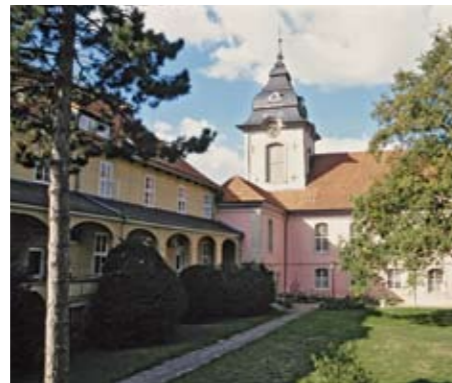
Steterburg monastery in Salzgitter-Thiede